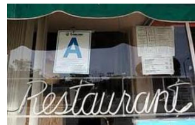
Figure 2: A New York City restaurant displaying its health inspection grade.